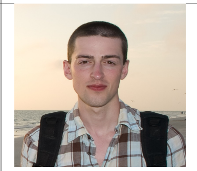
Phil Banks - Artwork