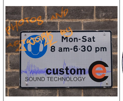
Custom Sound Studio - Recording