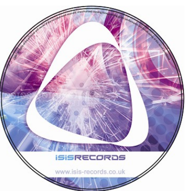
iSiS Records – The Label